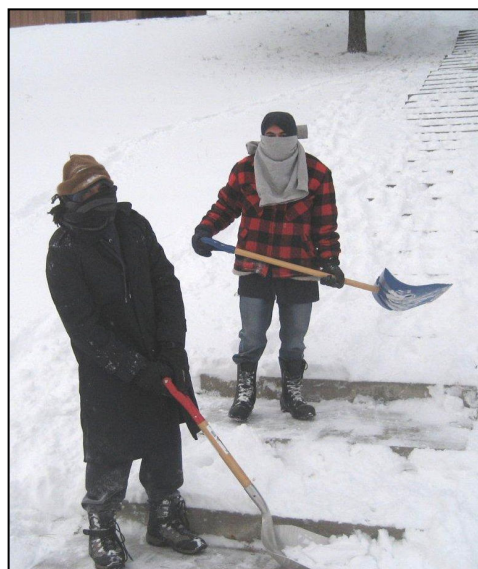
Can you identify the seminarians? (The first snowfall came with bitterly cold temperatures.)