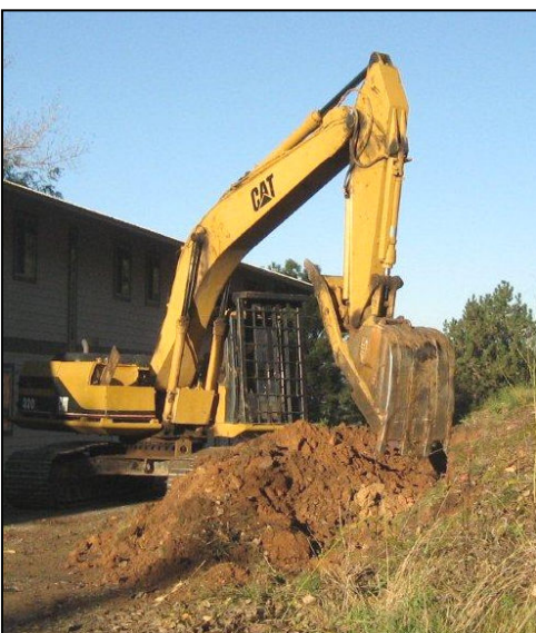
Heavy equipment was brought in to widen the road by the seminary.