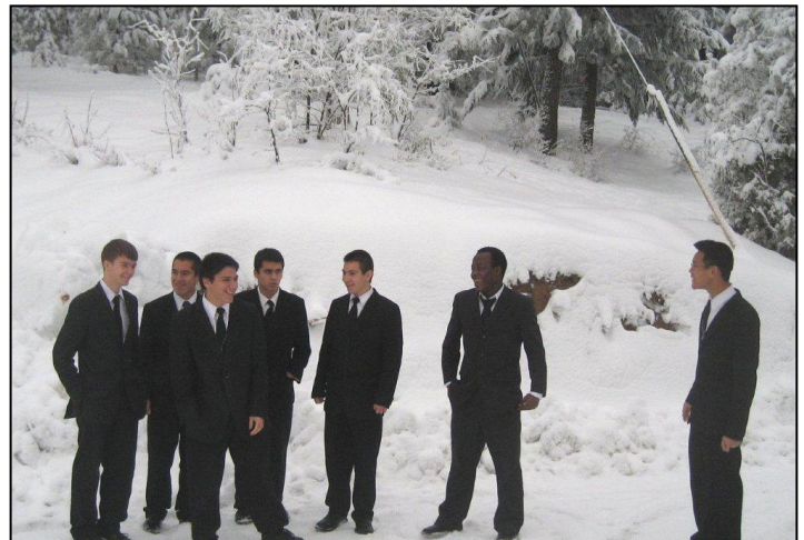
Several of our seminarians are experiencing snow for the first time.