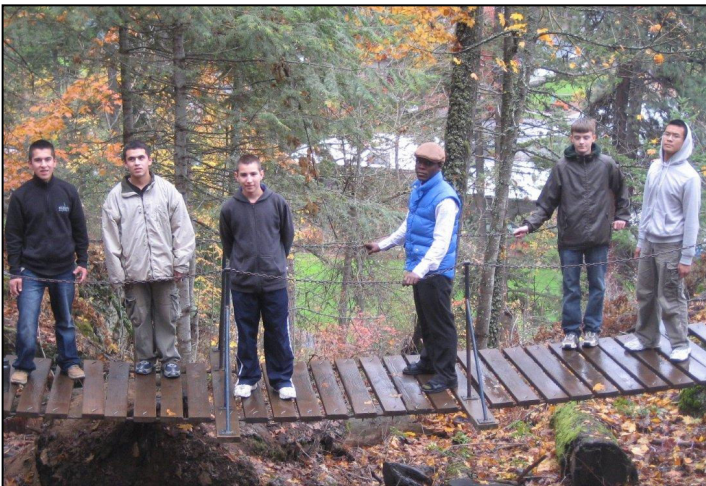
We paused for a break during a hike near Lake Coeur d'Alene.