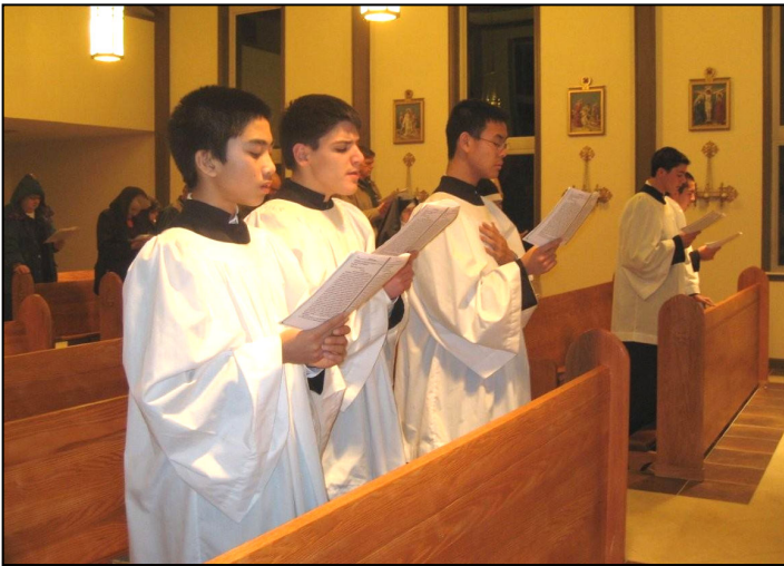
The seminarians join in the extensive chanting during the blessing of Epiphany Water.