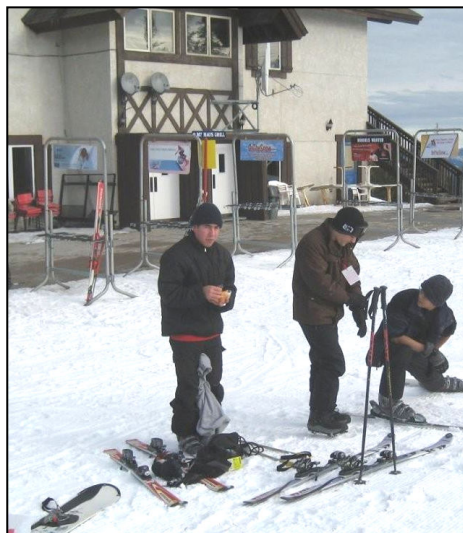
The seminarians check their equipment before hitting the slopes.