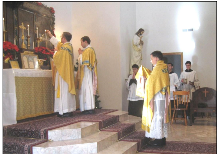
We celebrated the Feast of the Epiphany with a Solemn High Mass.