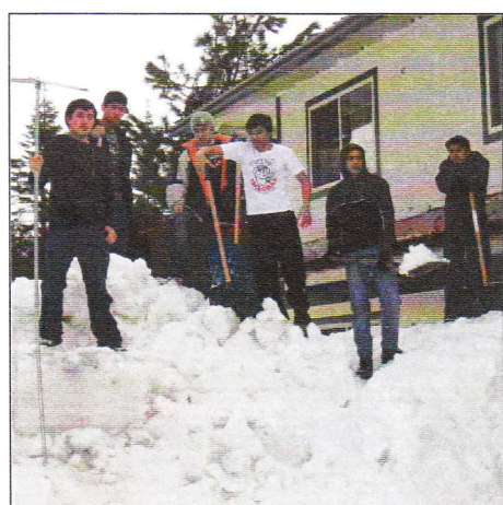
The seminarians had a real workout keeping the pathways around the seminary and church cleared of snow during January and February.