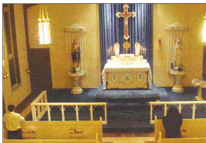
One of the greatest privileges of the retreat was our all-night vigil of adoration.