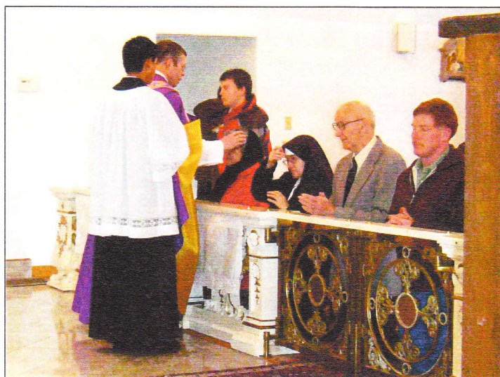
A seminarian assists Father in the distribution of ashes on Ash Wednesday.