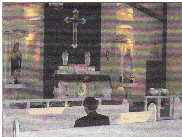
The seminarians' Lenten Retreat provided ample opportunity for quiet reflection with Our Lord in the chapel.