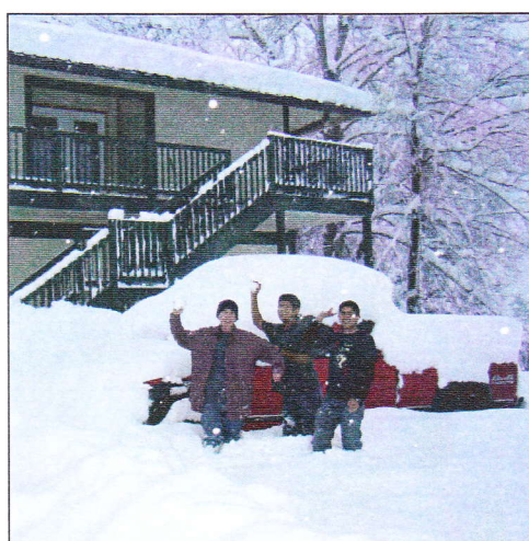
There were plenty of opportunities for snowball battles this winter!