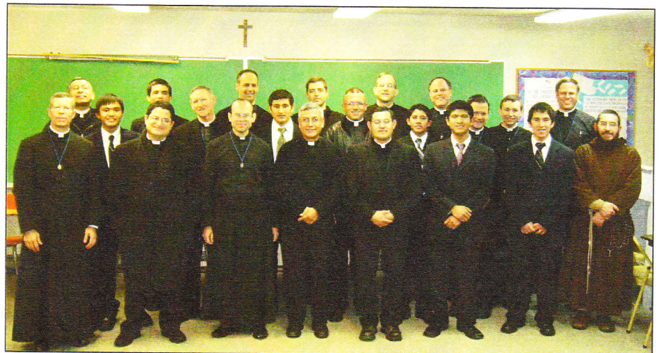
The seminarians enjoyed a visit from the priests who assembled for their annual meeting in January.

and God bless you" came. All of us are looking forward to the priests' meeting next year, which seems like quite some time in the future, but time goes by extremely fast at the seminary. And I am sure that next year I will be saying, "Is it really 2009?" I hope, that all of you and your loved ones, have a very penitential Lent and a most enjoyable Easter.