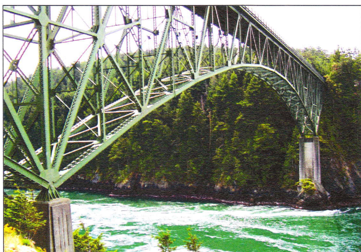
The bridge at Deception Pass in Puget Sound provides a spectacular view of the swirling waters below.