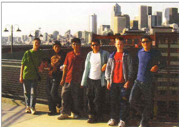
Here the seminarians pose with the Seattle skyline in the background.