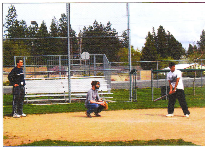
Some of the Mexican seminarians had never played baseball before this past spring.