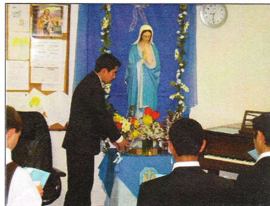
Every morning we greet Our Blessed Mother with flowers, prayers and a hymn.