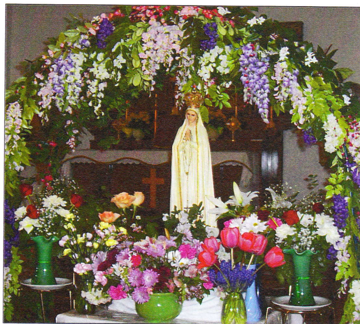
The shrine of Our Lady at the church is always adorned with many bouquets of flowers during May.

If you are a young man of high school age who has a vocation, then St. Joseph Seminary may be the place for you. Our four-year course of studies offers the regular high school curriculum, with an emphasis on Theology, Latin, choir and foreign language. A well-rounded program of daily Mass, prayer and sports complements our academic schedule. For more information, write to the rector of St. Joseph Seminary at the address below.