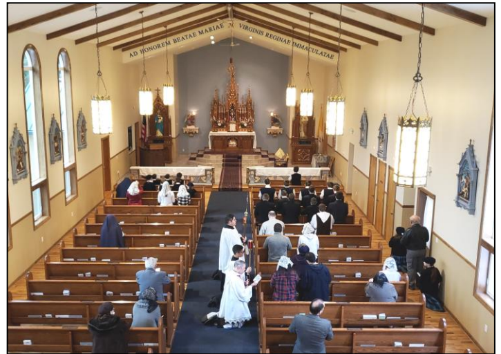
The Stations of the Cross are recited every Friday in our church.