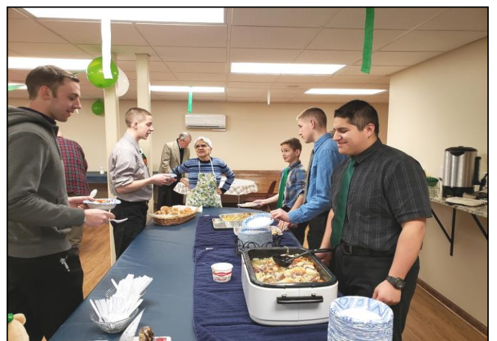
Fortunately, we were able to host our annual Irish breakfast before the prohibition against group activities due to the coronavirus.