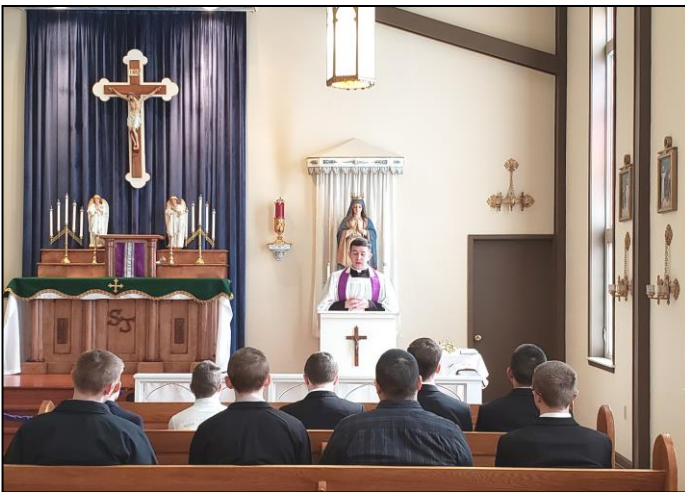
A scene from one of the spiritual conferences during the annual retreat.