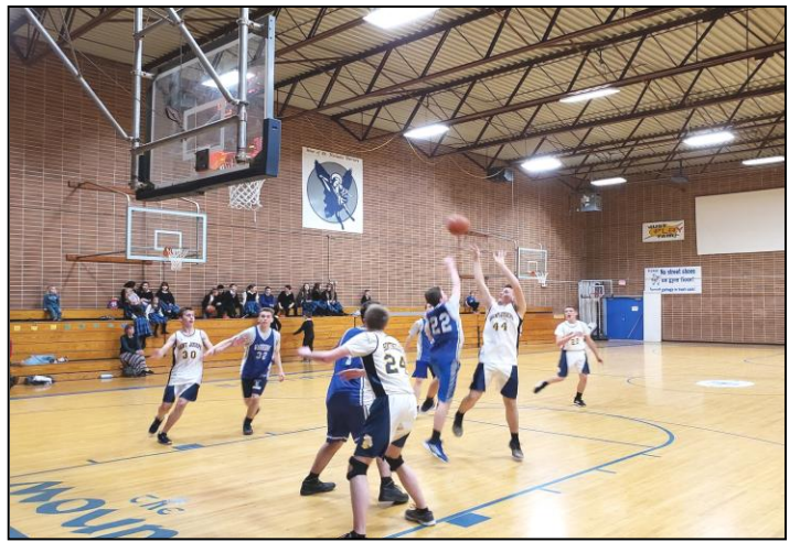
Our seminarians played two basketball games versus the students from Saint Michael's.