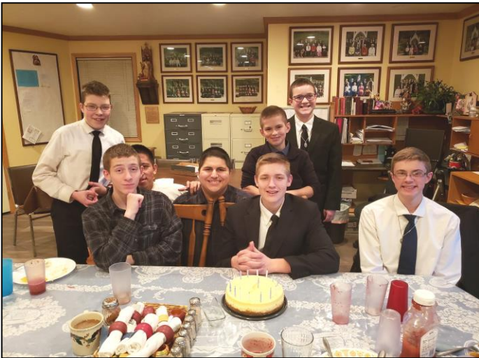
Celebrating one of the three birthdays during the month of March.