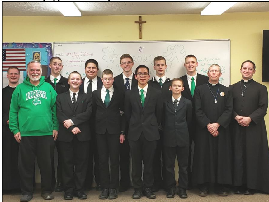
Following the Saint Patrick's Day talent show we posed for a group photo.

Another winter has passed, the twenty-first in the minor seminary's history. Each day passing into the next, into bitter or sweet memories, winter has gone. We look back and ask "what have we gained." Well, we are all a little older and hopefully a little wiser. We have learned useful traits such as learning how to ski and make blarney stones; how to stay hidden in a pitch-dark gym, to making pies and baked goods and how to properly wash white shirts. We have benefited from a holy Lent and a three-day retreat and have advanced in our spiritual lives. We are, however, all closer to eternity than the winter before. An estimated 150,000 people have died each day this winter across the world. Dear