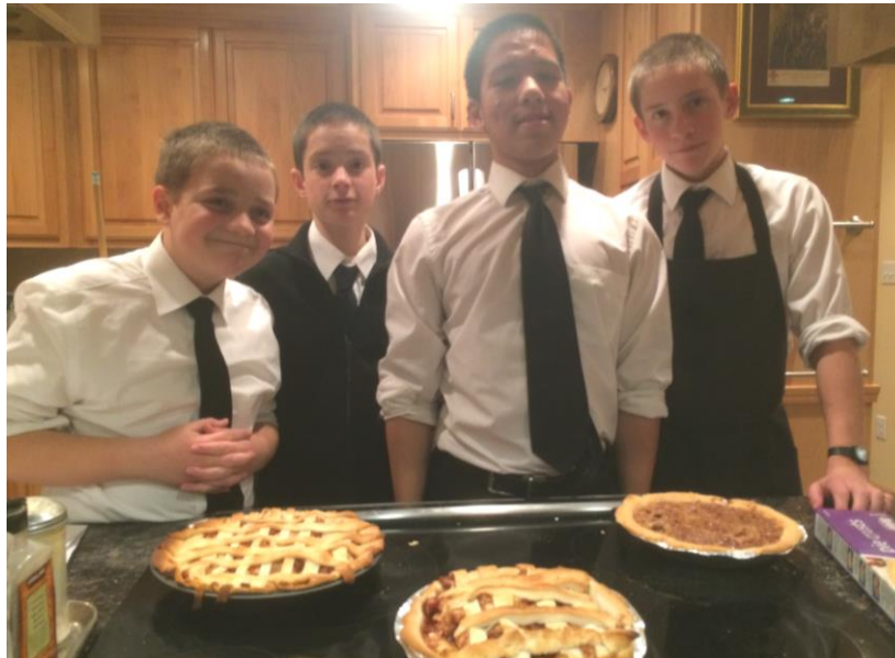
The seminarians baked some pies during the Thanksgiving Break.

found after the 10,000 th try that without patience it would be quite impossible to learn how to juggle. Besides it being impressive and fascinating to watch, juggling has many benefits and is also a very convenient hobby. It sharpens your concentration, improves your hand-eye coordination, and actually strengthens your biceps. For me, juggling is one of the more relaxing hobbies. To those of you