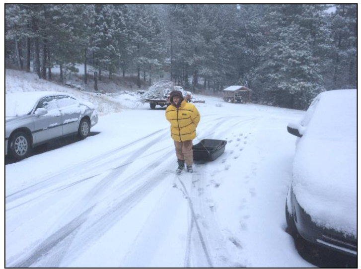
The seminarians take advantage of every snowfall for outdoor fun.