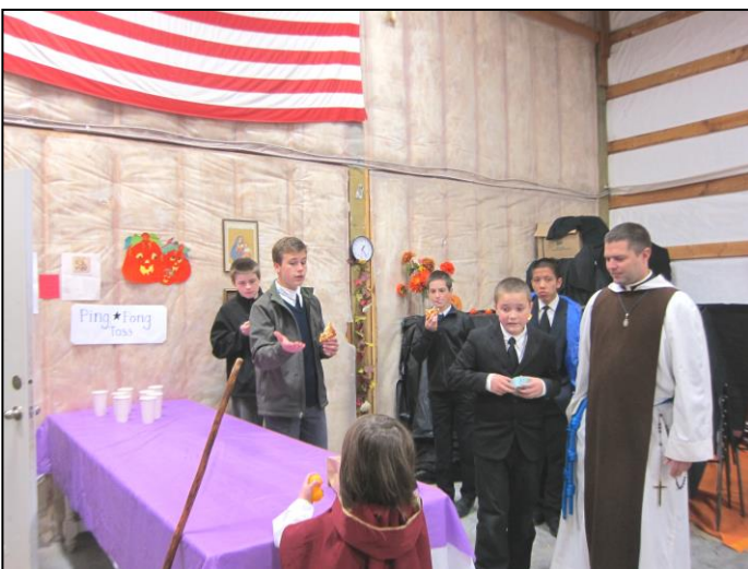
The seminarians joined in on the fun at the parish All-Saints party.