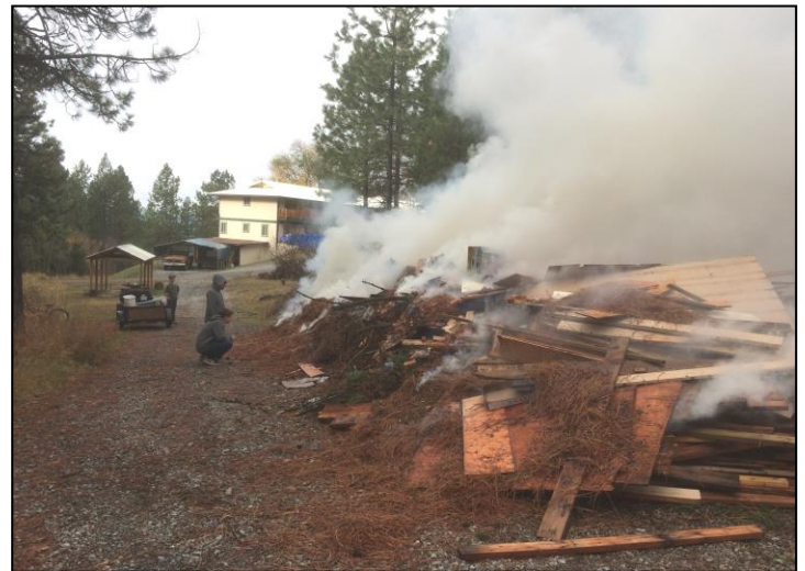
There was quite a large burn pile this fall.