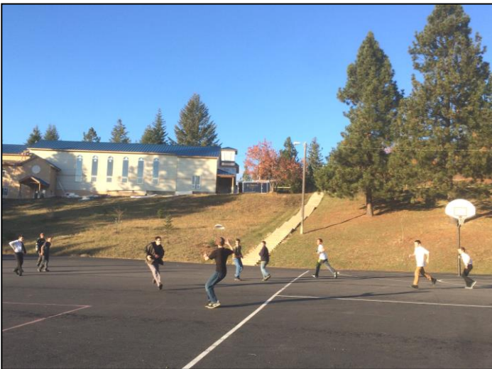
Frisbee football was the game of choice at P. E. on a beautiful fall afternoon.