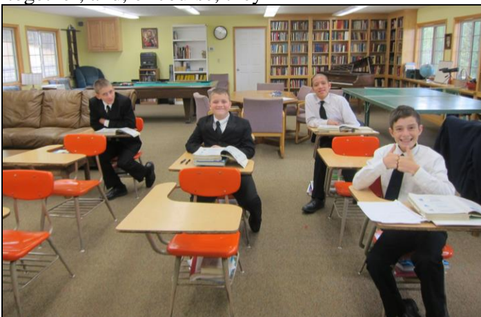
Happy seminarians started their classes last week.

seed germinates the small plant needs to be watered, sheltered and nourished during the early stages of growth. So too a vocation is a delicate seed that must be nourished and protected. Not only must a vocation be protected from the foul breath of the world, but good habits must be formed in the young men who will become Other Christs . During adolescence – that crucial period of physical, mental and moral development – lasting habits, either good or bad, are formed. In a preparatory seminary, even more than in the major