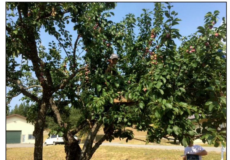
Can you spot the seminarian in the pear tree?