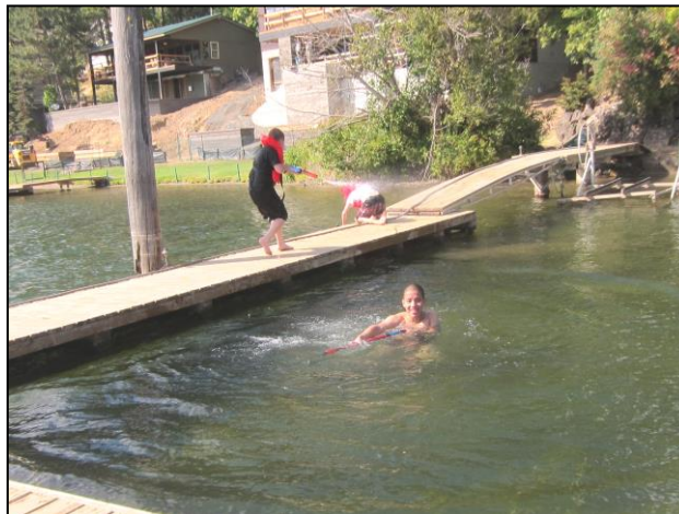
The seminarians could not resist the temptation to squirt water at one another.

will be as expected without the will of God, for He is almighty, our one and only God.