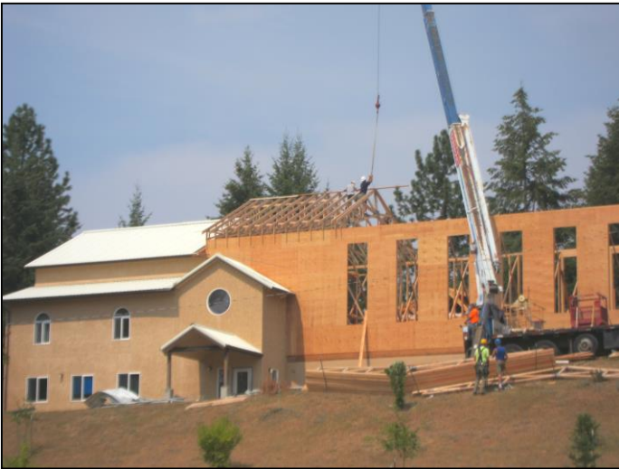
A crane was needed to lift the trusses into place on the roof of the church.