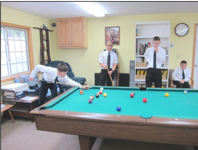
Can you guess the name of the most popular game at the seminary?