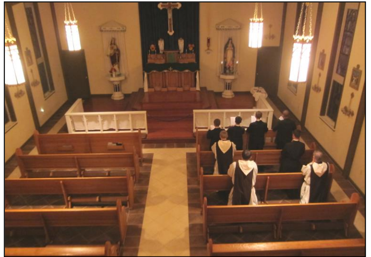
Night prayers in the chapel always conclude with the antiphon to Our Lady.