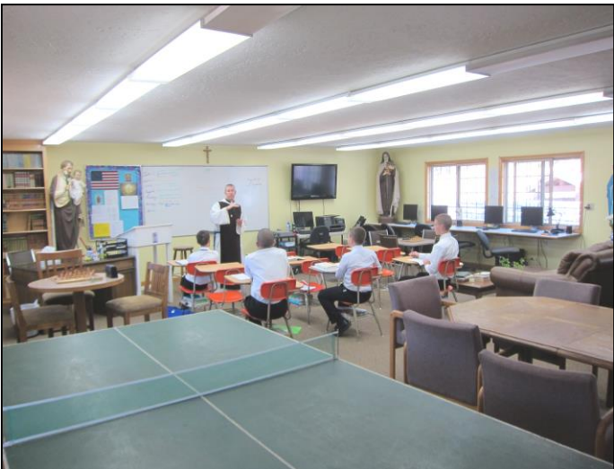
The first class of the day is Latin.