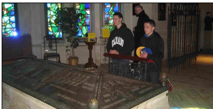
Our seminarians had the opportunity to visit the tomb of Fr. Flanagan at Boys' Town.

It has often been said that if a priest were to die after saying his first Mass, all the study, labor and sacrifices on his part, and on the part of anyone who helped him to approach