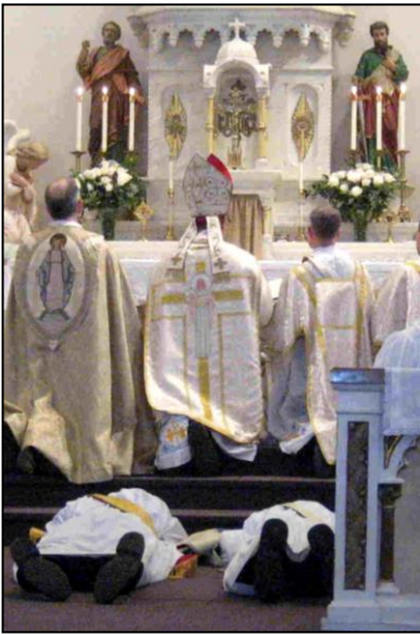
Before their ordination, the two deacons prostrated for the Litany of the Saints.