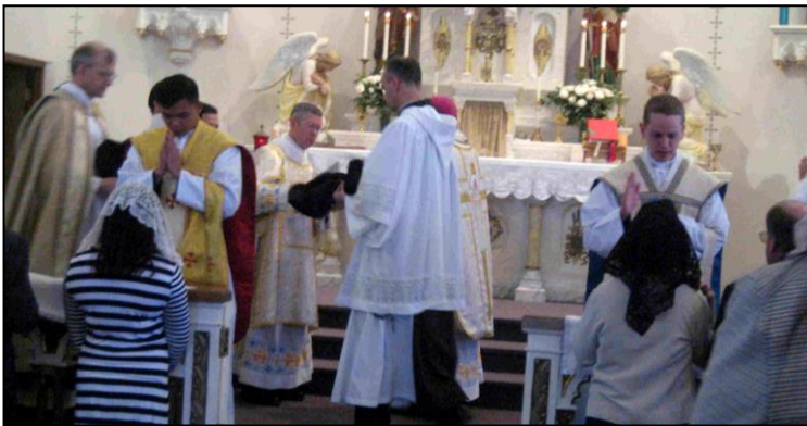
The new priests give their first blessing to their families.