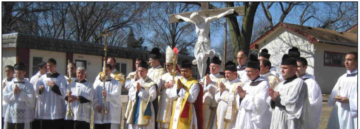
The bishop, priests and seminarians posed for this group photo after the ordination ceremony.