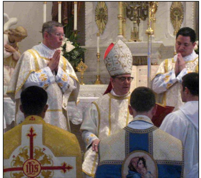
The bishop instructs the newly-ordained priests at the conclusion of the ceremony.