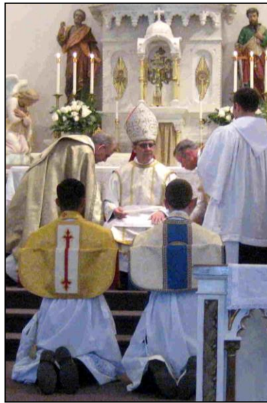
The bishop prepares to anoint the hands of the newly-ordained priests.