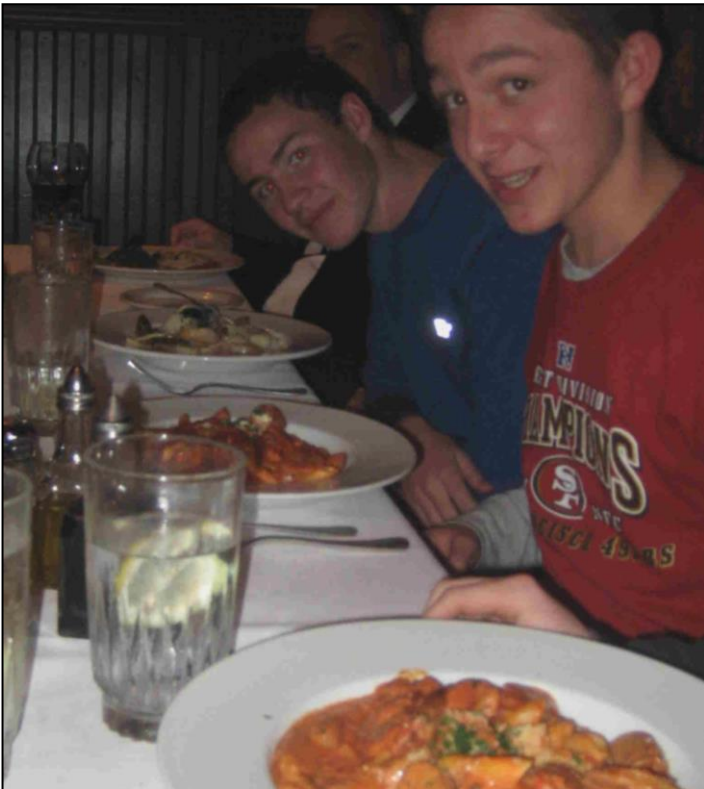
On All Saints' Day we had dinner at a nice Italian restaurant.