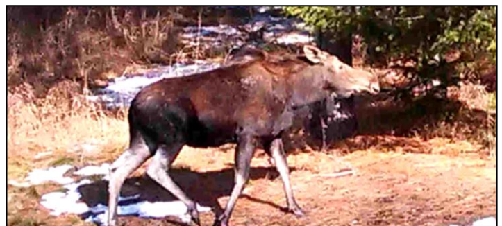
This moose has been seen foraging near the seminary.