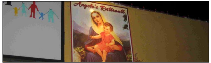
This Italian restaurant is adorned with many beautiful religious pictures and statues.