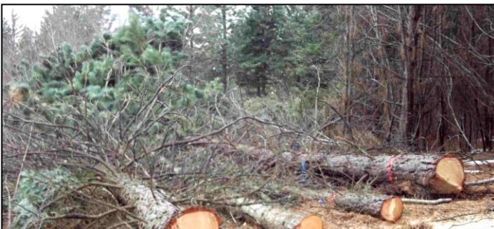
A recent project — cutting down pine trees by the cemetery to improve the view.