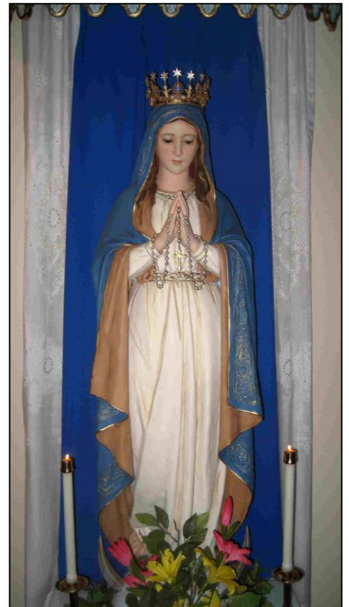
O Mary, conceived without sin, pray for us who have recourse to thee.