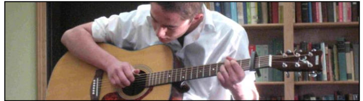
Our annual talent show featured various musical selections.