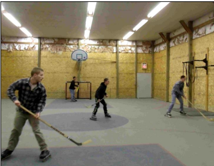
The seminarians enjoy playing hockey in the gym.